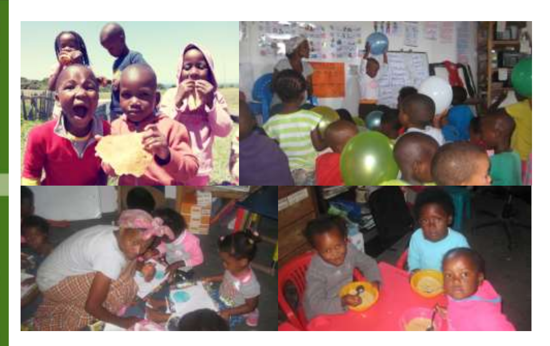
Term 4 The school was closed from the 2<sup>nd</sup> of October until 12<sup>th</sup> of October. In the fourth term we did a lot of revision with children, especially those that are leaving.

On the 27<sup>th</sup> of October we had a meeting with parents about our graduation party. We also talked about the progress of their children. We agreed that the graduation will be held on the 26<sup>th</sup> of November. They divided themself into groups; some were going to cook on the graduation day, others decorate the hall, others look after the children on that day.